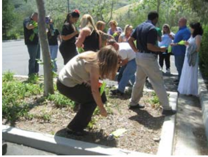
Candy and Cash!

a few. ITS' product suite ensures that our clients receive the best in the latest and greatest in communications technologies while simultaneously enjoying the highest class of customer service that can be found in the telecommunications industry today. These are all aspects of our company in which we take a great deal of pride in here at ITS, and plan to remain your one stop shop for all of your communications needs for another 21 years, then