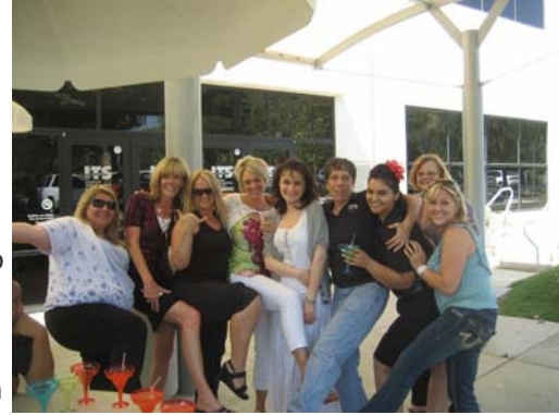
ITS Girls just wanna have fun!

some. Thank you for your loyalty! ITS is proud to have your business. Congratulations to ITS on 21 years. In the ever changing field of communications technology!